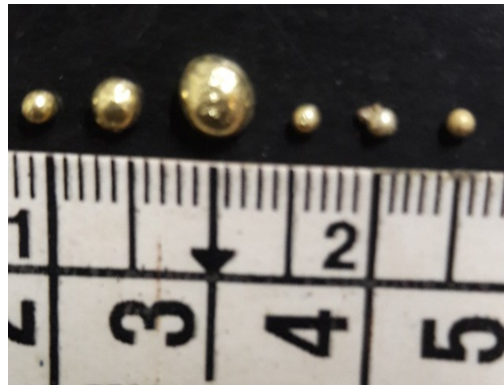
Photograph of gold buttons recovered after cupellation of Ema and Tres Estados bulk samples

BBX focused on the recovery of gold and silver rather than PGM's using this extraction process as the procedure was designed to replicate that of the 14 th August announcement. Additional work is in progress in both Brazil and Australia to further fine tune and streamline the extraction process. All metallurgical test results should therefore be considered as partial extraction results, reflecting the efficiency of the test methodology rather than representing absolute precious metal values in the samples.