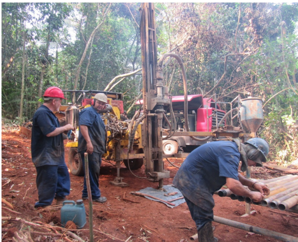
RC drill rig at Três Estados

On 20 September 2017 BBX announced that it had commenced reverse circulation (RC) drilling at the Três Estados prospect in late August.