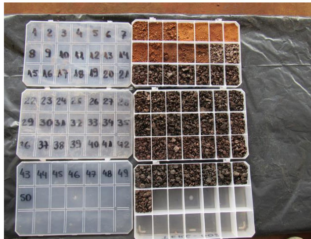
One metre RC chip samples from hole TERC 02 showing fresh gabbro from 13m.