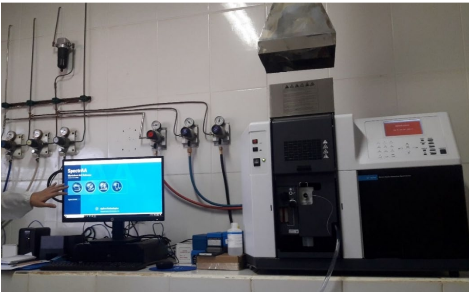
Figure 3: Newly purchased Atomic Absorption Spectrometer

In addition to the abovementioned enhancements to its existing laboratory, the Company also installed and commissioned a new Atomic Absorption Spectrometer ( Figure 3 ) purchased in the previous quarter. The AA is located and operated independently by a contractor at a nearby facility and is used exclusively for BBX's assaying programme.