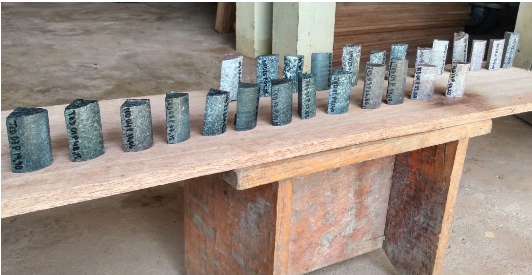
Figure 5: drill cores used in petrographic analysis