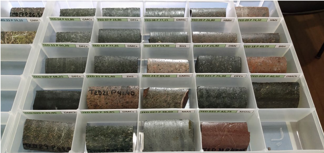
Figure 4: drill cores used in petrographic analysis